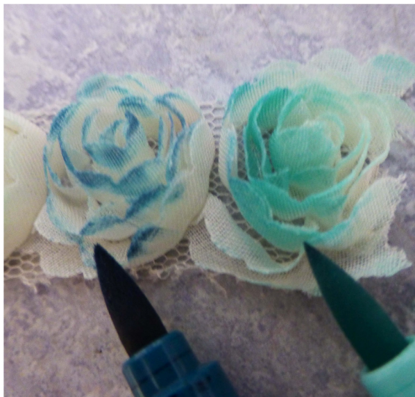
You can add color without dyeing by simply "brushing" color on With Stampin' UP! markers