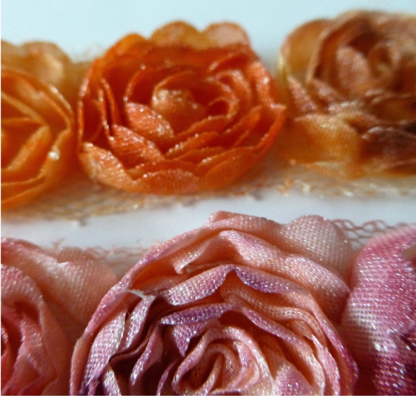
Add a little shine with spray made from frost white shimmer paint & alcohol